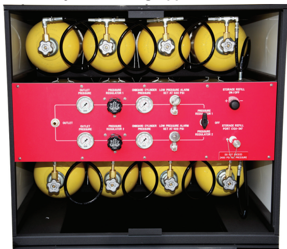
Long Duration Air Storage Hazardous Response Trailers