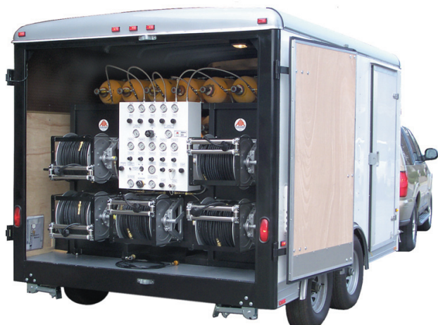
Emergency Response Open or Enclosed Trailers for Long Duration Breathing or Cylinder Filling Applications

Air Systems' experienced technical staff and engineering department can design a breathing air trailer with custom storage and air delivery for ANY application. Custom mobile air cylinder carts are available for industrial plant and emergency response applications.