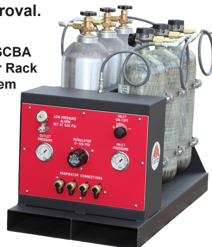
Small SCBA Cylinder Rack System

Call Customer Service for Additional Details